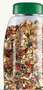
PLASTIC FOOD SERVICE JAR 400g - 600g