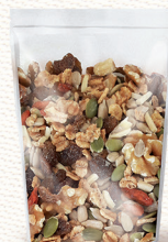
DOY STYLE 50g - 100g