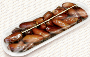
PLASTIC TRAYS 250g aprox.