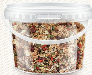
BIG TUBS 1Kg - 1,4Kg