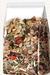
BLOCK BOTTOM BAGS 55g - 150g