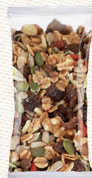
PILLOW BAGS 35g - 150g