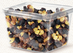
BLISTER BOX 300g - 500g