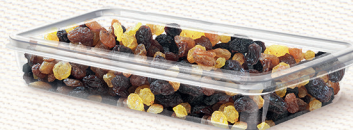
BLISTER BOX 175g - 250g