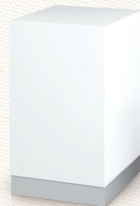
SLEEVE CARTON BOX 80g - 100g