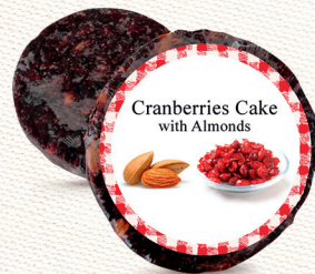
PLASTIC FILM 200g