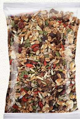
PILLOW BAGS 500g - 1Kg