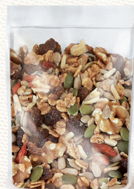
DOY STYLE 100g - 250g