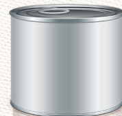
TINS 135g - 200g