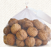
MESH BAG 150g - 500g