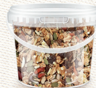
MEDIUM TUBS 600g aprox.