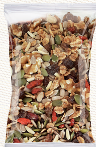
PILLOW BAGS 200g - 500g